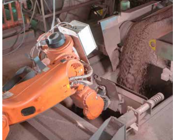
Sinter raw mix sampling during conveyor discharge