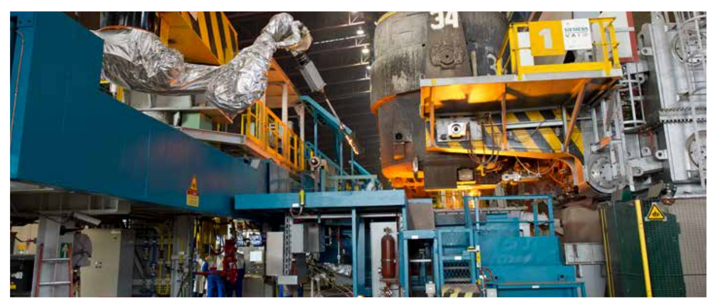
Single strand slab caster, voestalpine Stahl, Linz, Austria